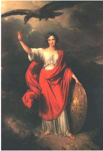
(Artist: Johann Ender Date: 1831)

Why do you enter the evil womb! O mortal! Why is your course downward! O mortal! Why do you wonder about affected by the pairs of opposite like pleasure and pain. Why are you affected by the bright or dark fruits of action! O mortal!