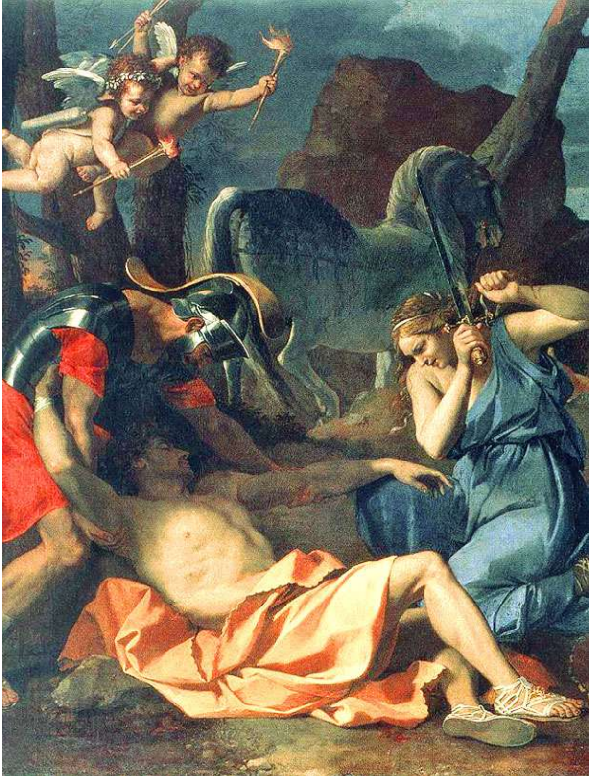
(Artist: Nicolas Poussin Date: 1594 - 1665)