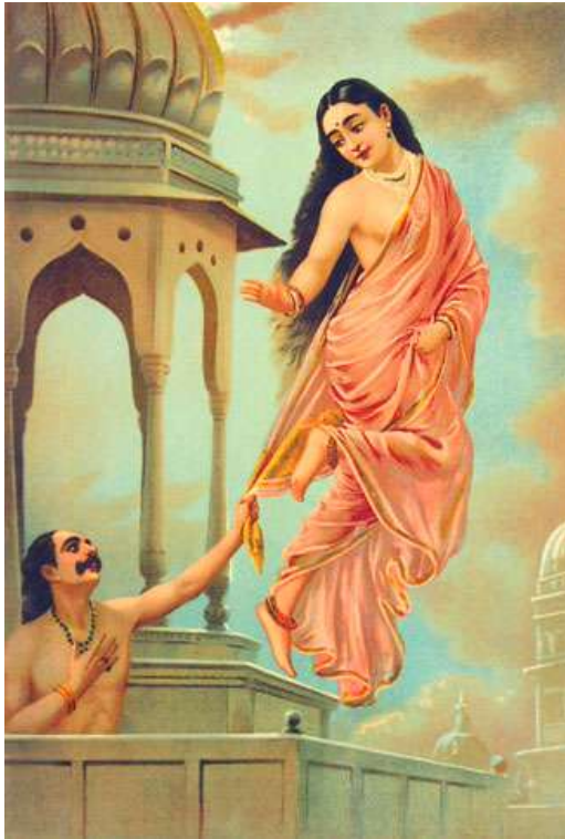
(Artist: Raja Ravi Varma)

Are not smoke, light and sparks the mark of a fire.